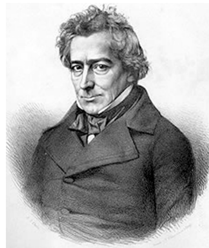
Jacop van Lennep was a 'romantic' author who wrote several novels with a historic background