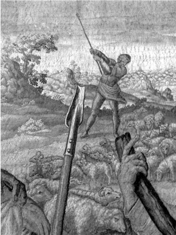
Legend has it that golf was invented by shepherds who hit for one reason or the other pebbles into rabbit holes – Detail of a tapestry in Hôtel Dieu, Beaune, France