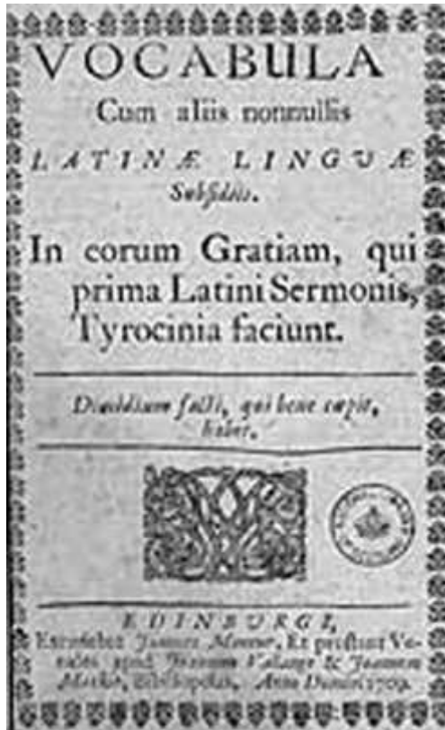
Frontispiece of David Wedderburn's 'Vocabula', 1636, in which he included the hole in the game of golf: 'Dirige recta versus foramen', meaning 'Strike directly upon the hole'