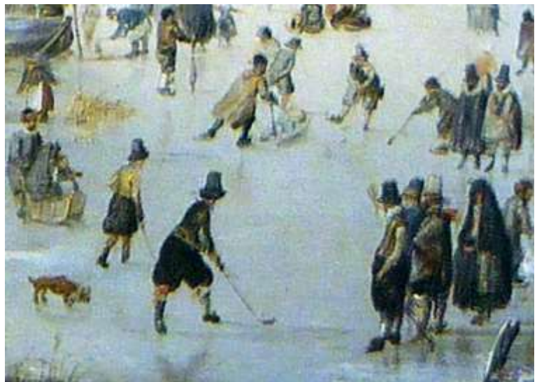
Detail of a winter landscape by Hendrick Avercamp, a colf player is directing his ball to a hole in the ice. A fore caddy shows with a stick where the hole is. Hendrick Avercamp, 'Winter scene with skaters by a windmill' – Private collection